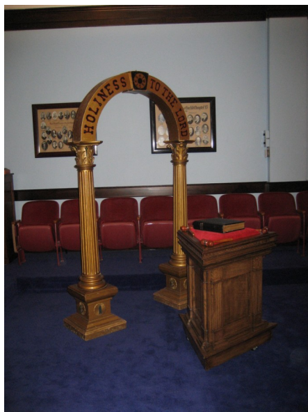
Euclid Chapter 13, R.A.M. Arch and Altar